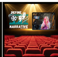
Documentary Associate Producer Partner